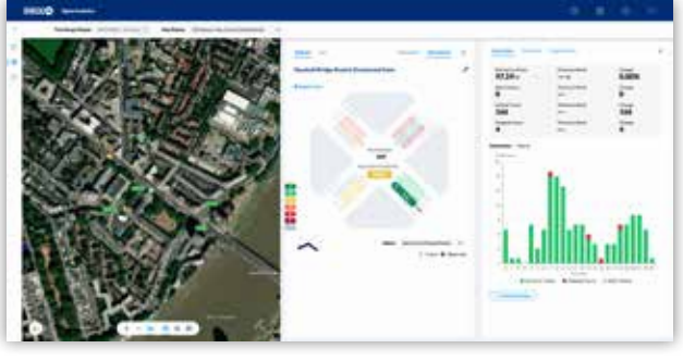
Signal Analytics display of a junction in London, where important statistics can be visualised.