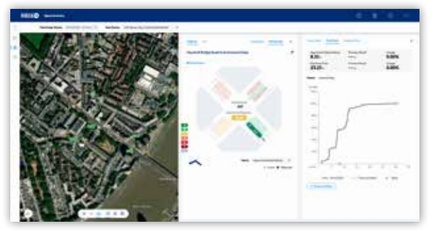
Delay and Level of Service can be visualised for each directional movement.

By transforming trillions of data points into detailed and transparent metrics and trends, Signal Analytics helps to quickly answer almost any junction and corridor related question to prioritise traffic signal projects and make meaningful improvements.